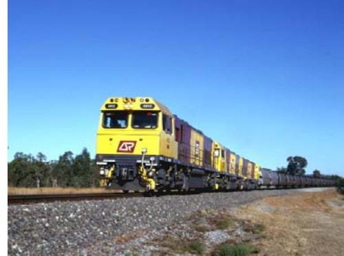
QR Train similar to those that will be used to haul Sonoma Coal

Chris Wallin said "This is a great milestone for the Project. QR has worked closely with the QCoal team and we are very pleased with the relationship that has been built". Coal from the Sonoma Project will contribute to the Stage 2 expansion at the port of Abbot Point and will be transported using the standard train configuration operated by QR on the Newlands rail line. Each diesel train will transport on average 4,680 tonnes of coal and consist of approximately 75 wagons. Exploration continues on site to expand the known Sonoma reserves.